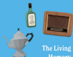
The Living Memory Association

Although we will use the funds to continue the project that was initially funded, the fact it is unrestricted leaves us free to put it to the best use for the charity's work if need be. For a funder to offer us this is really unusual and yet so beneficial to our work and flexibility with funds."